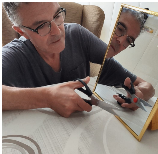
Figure 1 In the intervention set up for mirror therapy, the participant looks at the reflection of the unaffected hand in the mirror as if it was the affected hand.

MT can be used in three different modes. In the first mode, the patient tries to imitate the movement of the healthy hand with the affected hand in a synchronised way. In the second mode, the patient only imagines that the reflected movement of the healthy hand is being performed by his affected hand. In the third mode, the therapist assists the patient's affected hand to imitate the movement performed by the healthy hand. Considering