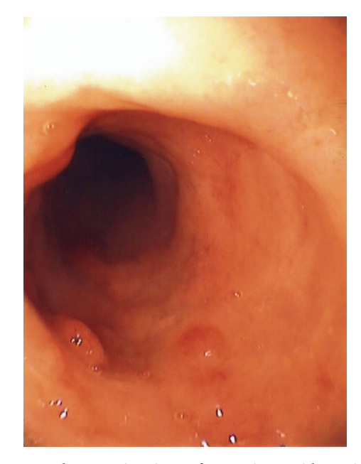
FIGURE 2: Colonoscopic view of a patient with eosinophilic colitis showing mild inflammatory changes, mucosal edema, patchy erythema, and loss of vascularity.

<10 eosinophils per high-power field in the rectum to >30 in the cecum [17], thus, location of colonic biopsy is critically important for proper interpretation of findings. Histological features include focal aggregates of eosinophils in the lamina propria, crypt epithelium and muscularis mucosa (Figure 3).