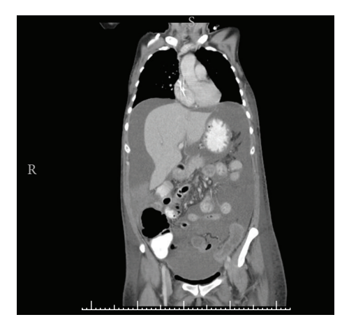
FIGURE 1: Computed tomography of the abdomen and pelvis showing colonic wall thickening and ascites in patient 4 with full-thickness eosinophilic colitis.

At colonoscopy, some patients have lymphonodular hyperplasia while others have endoscopic features of mild colitis including mucosal edema, patchy erythema, and loss of vascularity (Figure 2). Changes can occur throughout the colon but tend to be more prominent in the ascending colon and rectum. The only clear diagnostic criteria for any of the EGID entities pertain to eosinophilic esophagitis, which is defined by the presence of more than 15 eosinophils per high-power field in the esophageal squamous mucosa [16]. No such consensus exists for EC, although most authors have used a diagnostic threshold of 20 eosinophils per high-power field. Of note, normal values for tissue eosinophils vary widely between different segments of the colon, ranging from