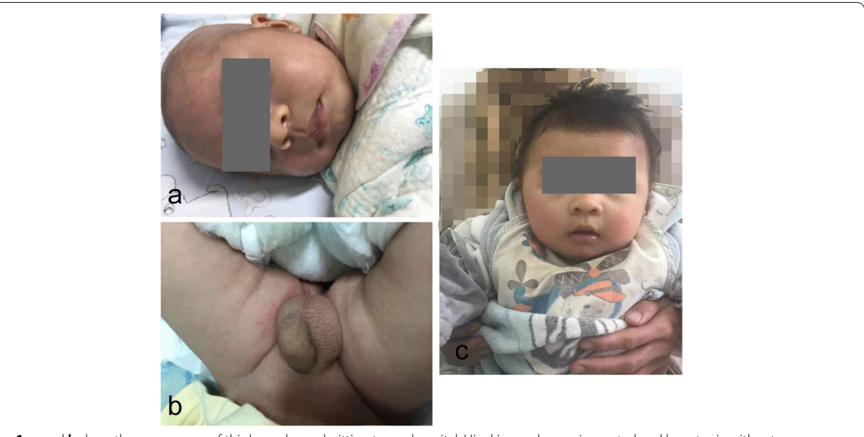
Fig. 1 a and b show the appearance of this boy when admitting to our hospital. His skin was hyperpigmented and hypotonic without subcutaneous fat. c reveals the boy gained weight and his skin color was relatively normal after treatment at 5 months of age and his mother held him on her leg (the photo was cropped)