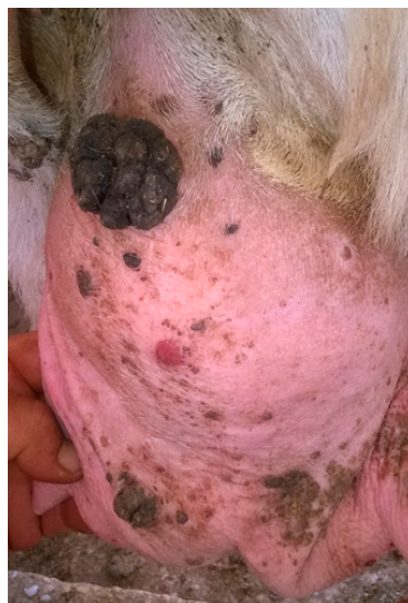
Figure 3. Macroscopic features of the analyzed sample: a large cauliflower lesion on the udder of a ewe.

A large (>10 cm) cutaneous lesion with a verrucous hyperkeratotic cauliflower-like aspect was excised from the udder of a ewe on a farm in Trapani province (Sicily) (Figure 3). Clinically, the lesion was classified as papilloma. This animal was farmed in a sheep holding, without any cattle reared in the same structure, even though a pasture shared by cattle and sheep was reported by the animal owner.