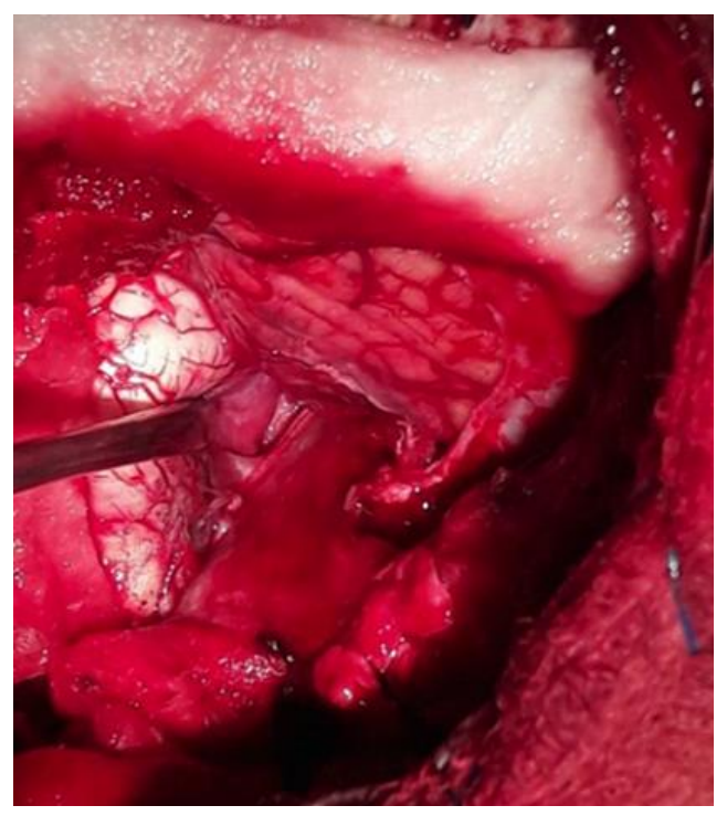
Figure 3: Peroperative photograph shows the microsurgical removal of foramen magnum meningioma trough a midline suboccipital approach