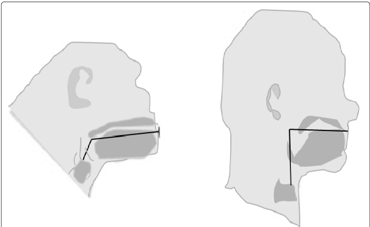
Figure 3 The Homo species supralaryngeal tract. The Homo species supralaryngeal tract (right) is characterized by horizontal portion (i.e., mouth and oropharynx) forming a right angle of approximately equal lengths of 1:1 proportion with a vertical segment extending down from the palate to the vocal cords. In comparison, the chimpanzee (left) has a hyoid bone and larynx positioned at or near the base of the mandible; and, the tongue is long and mostly restricted to the oral cavity, resulting in a disproportionate supralaryngeal vocal tract. Human ancestors such as Homo erectus and Neanderthal chronospecies possessed supralaryngeal vocal tracts intermediate in shape between those of chimpanzees and humans. (Adapted from [108]).

The growth in the size of the human cortex permits better control of voluntarily speech and song production (and laryngeal muscle movements) as opposed to the limited voluntary control over vocalizations displayed by non-human primates [102,103,112-114]. Hundreds of millions of years before, the larger brain size of ancestral mammals compared to their closest extinct mammalian relative is in response to the high resolution of olfaction, prominence of odorant genes and growth of odorant receptors [104]. The relationship between keen olfaction and brain size is changed in the Homo species as they adapt speech over olfaction. The genes regulating brain size and behavior exhibit higher rates of protein evolution in the lineage leading from ancestral primates to humans [112]. The abnormal spindle-like microcephaly-associated gene ( ASPM ) may have been the evolutionary target for the initial expansion of the hominid cerebral cortex; and, changes regarding human speech are likely accelerated after the FOXP2 regulatory gene reaches its