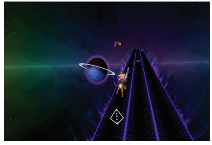
Figure 1. With subtle head movements (looking left or right), the player directs the character to the treats, which are laid out to the beat of the music.

During the Space Pups<sup>™</sup> experience, patients choose from one of five different pups that they steer down a highway in outer space, collecting treats from one of three highway lanes that synchronize with the beat of music (Figure 1). The patient or clinician can change the horizon line orientation of the highway at any point during the game by triple swiping the side finger pad on a Samsung Gear VR or by holding down the App button (center button) on the Lenovo Mirage remote controller (Figure 2). Patients were excluded from VR use if they had any of the following- significant cognitive impairment, history of severe motion sickness, current nausea, prone to seizures, visual problems, clinically unstable, or required urgent/emergent intervention.