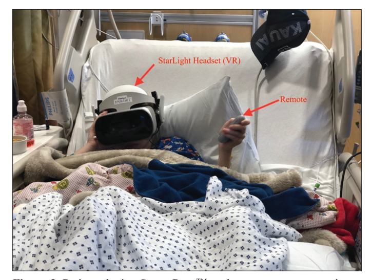
Figure 2. Patient playing Space Pups<sup>TM</sup> as the nurse prepares to give medication. Once the character is chosen, the patient uses either head movement or the remote to navigate his character in Space Pups<sup>TM</sup>.