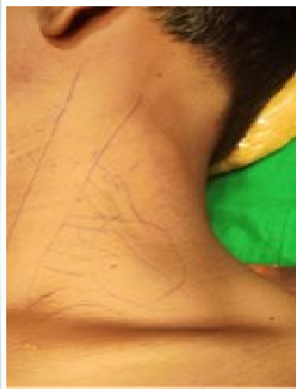
Figure 2: Pre-operative workup: Incision marking over posterior triangle.

patient complained of tingling sensation over tips of all fingers and some loss of grip strength of left hand. Discriminative sensibility remained unaltered. On examination, a single, firm mass was palpable in the left supraclavicular fossa. The mass was tender and not adherent to the overlying skin. He had MRC grade 3 power of left wrist extension. There was no Tinel's sign in relation to the mass and his brachial, radial, and ulnar pulses were well felt.