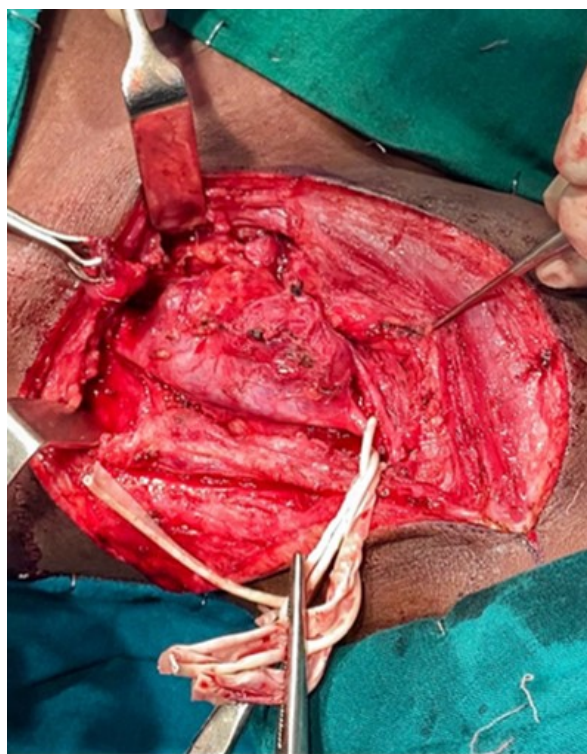
Figure 3: Intraoperative pathology: Intraoperative picture showing isolated vascular lesion.