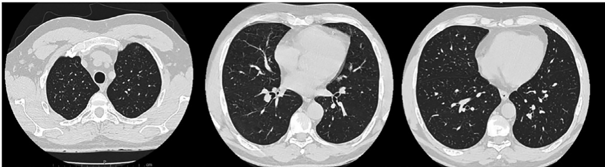
Fig. 2 CTscan, four months after the onset of disease, showing complete resolution of the lung opacities.

in the literature. 5,6 In our case, the patient presented a sub-acute onset of symptoms, initially presenting three weeks after the COVID-19 diagnosis with lung opacities and blood eosinophilia and then confirmed BAL eosinophilia. This patient was not taking any chronic medication and was not exposed to smoking, illicit drugs, or toxins and showed a dramatic response to corticosteroid treatment. This clinical case supports the already current evidence in which it is important to consider the development of interstitial lung disease in patients with COVID-19 including eosinophilic pneumonia. Despite the absence until now of a known mechanism for eosinophilic pneumonia in SARS-CoV-2, we believe that just as with other viruses, SARS-CoV-2 in rare cases can trigger an eosinophilic response. 7