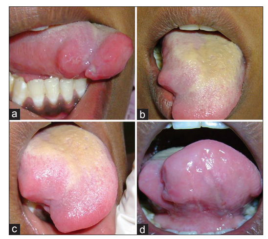
Figure 4: Images showing postoperative follow up after (a) 3 months (b) 6 months (c) 1st year (d) 2nd year