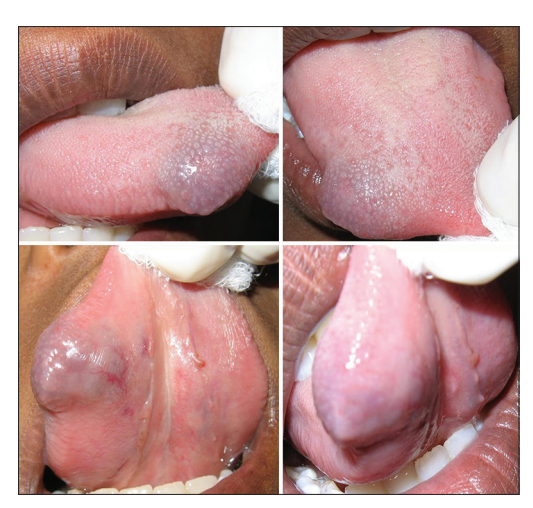
Figure 1: Intraoral photograps showing dorsal and ventral extension of lesion on tongue

The routine blood and urine investigations were normal. Color Doppler ultrasound revealed hypoechoic lesion measuring 1.3 x 0.5 cm seen in the right anterior lateral aspect of the tongue with intermittent color picking suggestive of vascular lesion. Before surgical excision, feeder vessel was identified by Color Doppler ultrasound. Legation of the feeding vessel was done and surgical excision [Figure 2] was carried out under general anesthesia. Histopathological examination [Figure 3] confirmed the definite diagnosis of cavernous hemangioma. Patient follow up [Figure 4] was done for two years and all the tongue movements were normal and there was no recurrence of the similar lesion.