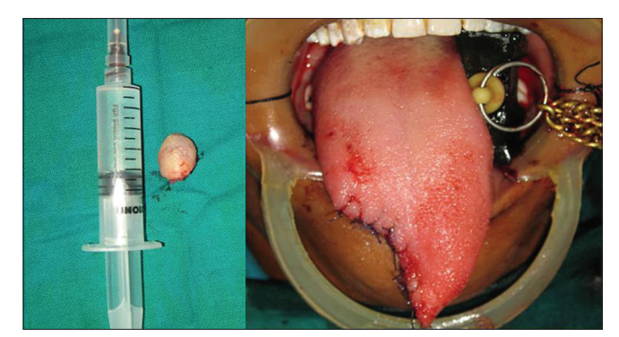
Figure 2: Photograph showing gross specimen of the lesion and intra oral view after surgical excision

Clinically hemangiomas are characterized as a soft, smooth or lobulated, sessile or pedunculated and may be seen in any size from a few milli-meters to several centi-meters. The