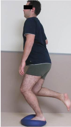
FIGURE 2: One leg standing exercise on unstable surface.