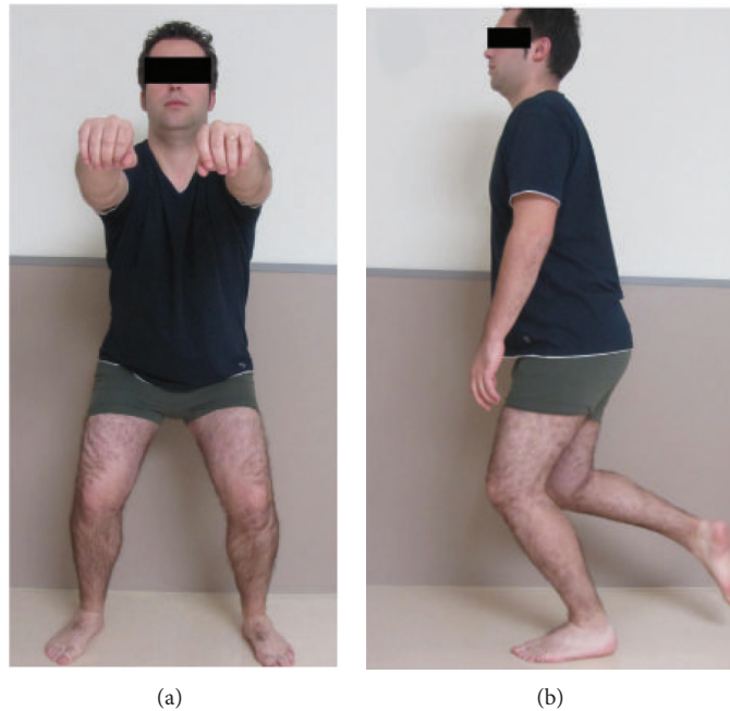
FIGURE 1: Closed kinetic chain exercises on stable surface: (a) bilateral semisquats; (b) one leg standing exercise.

2.3. Randomization. Following the baseline examination, patients were randomly assigned to receive proprioceptive/strengthening exercise program alone (control group) or proprioceptive/strengthening exercise program combined with TrP-DN into the lateral peroneus muscle (experimental group). Concealed allocation was performed using a computer-generated randomized table of numbers created prior to data collection by an external researcher. Individual and sequentially numbered index cards with the random assignment were prepared. The index cards were folded and placed in sealed opaque envelopes. A second external researcher opened the envelope and proceeded with treatment according to the group assignment.