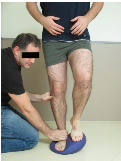
FIGURE 3: One leg standing exercise on unstable surface including perturbation training by the therapist.

focus on motor control of eccentric contractions of the ankle muscles to boost this musculature for proper contribution to ankle stabilization [32].