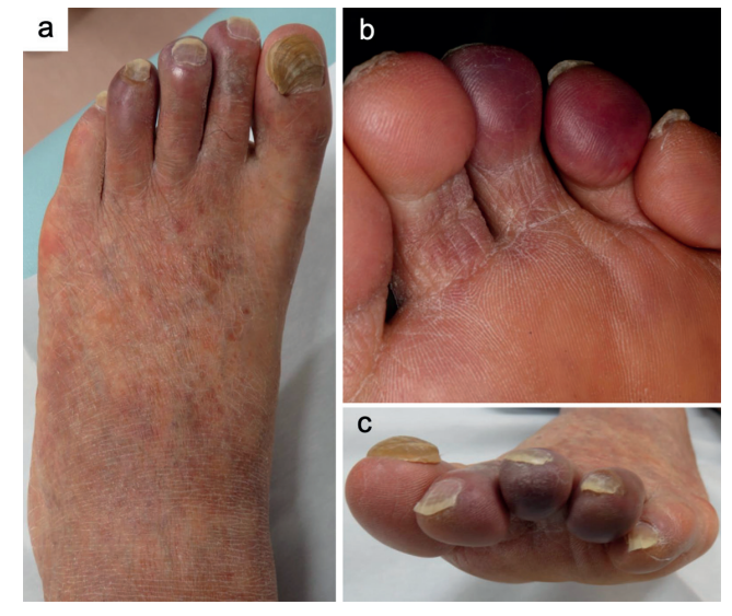
Fig. 1. Clinical findings. (a-c) Painful purple skin lesions on the patient's left 2–4 toes. Brown macular and punctate purpura on the left dorsum of the foot.

CIA: common iliac artery; EIA: external iliac artery; SFA: superficial federal artery; GW: guide wire.