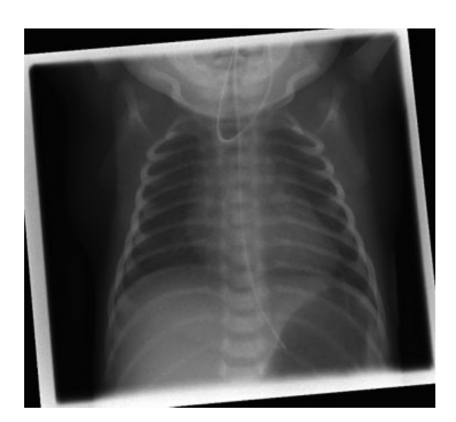
Fig. 1 Early chest X-ray.

SP-B is a 79 amino acid protein. There is a single gene on the short arm of chromosome 2 (2p12-p11.2) responsible for encoding SP-B.<sup>10,12</sup> SP-B is a hydrophobic protein comprising 2% of surfactant composition. It is secreted by type II epithelial cells as a large precursor protein (proSP-B). ProSP-B is split by proteolytic enzymes at the amino- and carboxyl-terminus, resulting in a smaller and extremely hydrophobic peptide.<sup>7,13,14</sup> SP-B is synthesized in the endoplasmic reticulum. mRNA is translated into a 381 amino acid preproprotein, of which the first 23 amino acids comprise a signal peptide that is co-translationally removed.<sup>4</sup> SP-B is transported