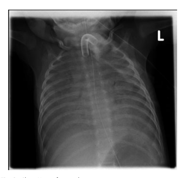
Fig. 2 Chest X-ray after tracheotomy.