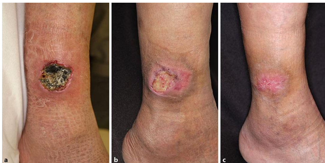
Fig. 2. a Ulcer with prominent necrotic tissue on the right shin. b Just before the administration of bexarotene. c Eight weeks after the administration of bexarotene.