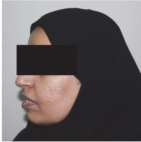
FIGURE 1: Clinical picture of the patient demonstrating the pitted skin of the cheeks.