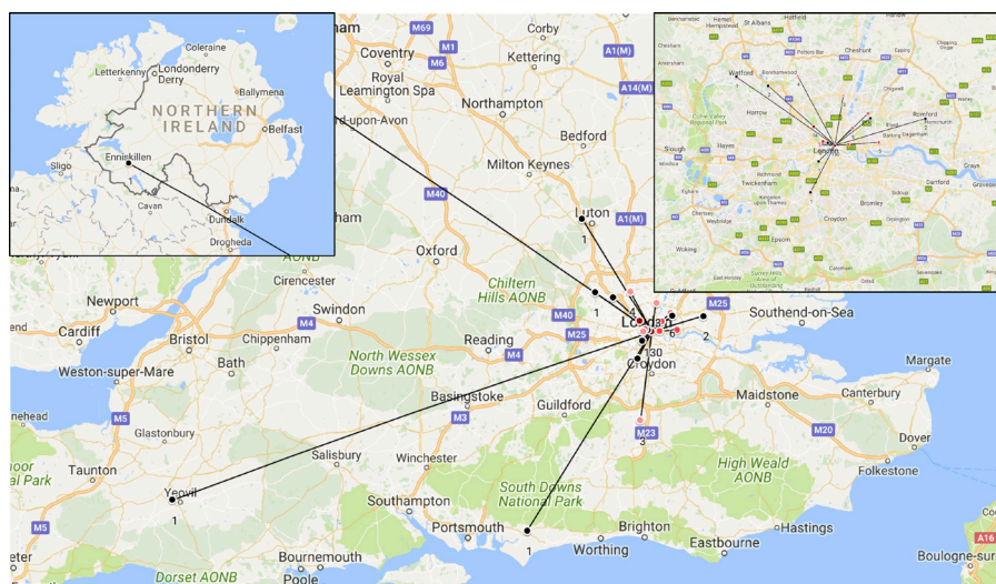
Figure 3 Catchment of external referrals to the newly established service.

This was achieved by creating change with evidence-based pathway redesign, introducing cultural change and new ways of working across silos of hospital practice. The need for new working practices to provide this service are recognised by the Royal College of Radiologists, British Cardiovascular Society and British Heart Rhythm Society guidelines. 13 14 We specifically sought to understand and address barriers to service provision. Staff did not feel confident performing scans due to lack of training and so we concentrated experience in specific individuals. Logistically, it was difficult to collate the information needed to protocol scans. Training of the bookings team using a specific proforma similar to international guidelines ensured all decisions were made beforehand and delay was minimised at the scanner-side. 5 By creating a transparent