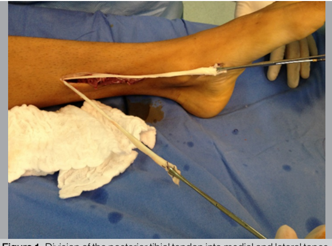
Figure 1. Division of the posterior tibial tendon into medial and lateral tapes.