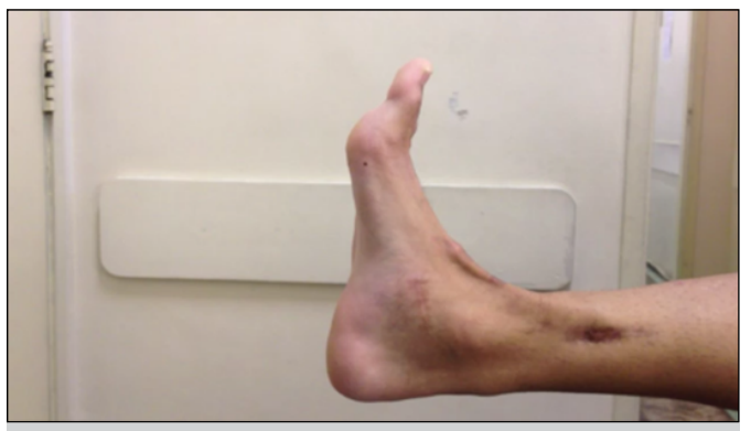
Figure 8. Case 15 performing active dorsiflexion.