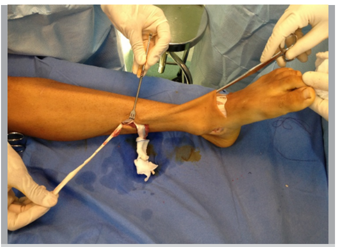
Figure 2. Use of tunneling clamps to subcutaneously transfer the posterior tibial tendon.