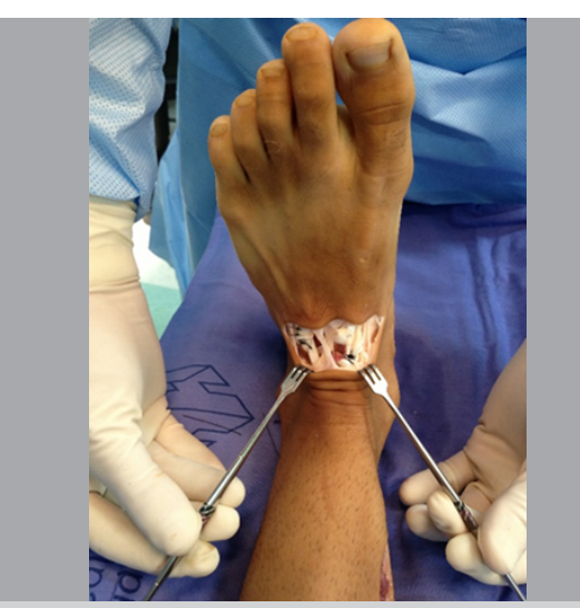
Figure 5. Final aspect.