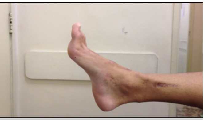
Figure 7. Case 15 performing active plantar flexion.

Table 2. Sample patients' Activity Limitation and Safety Awareness, social participation, and the American Orthopaedic Foot and Ankle Society ankle-hindfoot scale scores.