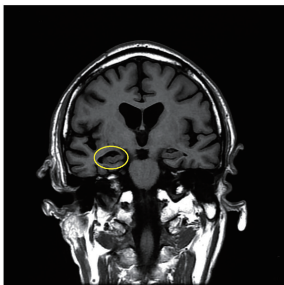
Figure 3. Brain magnetic resonance imaging findings (coronal section). There was a difference in hippocampal size on the left and right, but no abnormality was noted by the radiologist. We ultimately determined this finding to have little pathological significance.

values ; however, the radiologist interpreted these findings as having no significant abnormality. Ultimately, we determined that these MRI findings showed few pathological signs. In the electroencephalogram (EEG), \alpha activity of 9–11 Hz and 30–80 \mu V were observed and there were no abnormal find-