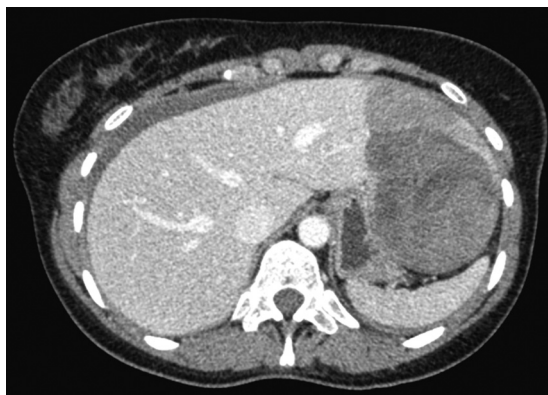
Fig. 1. CT-scan showing the hematoma and the 38-mm tumor in the left hepatic lobe in patient 1.