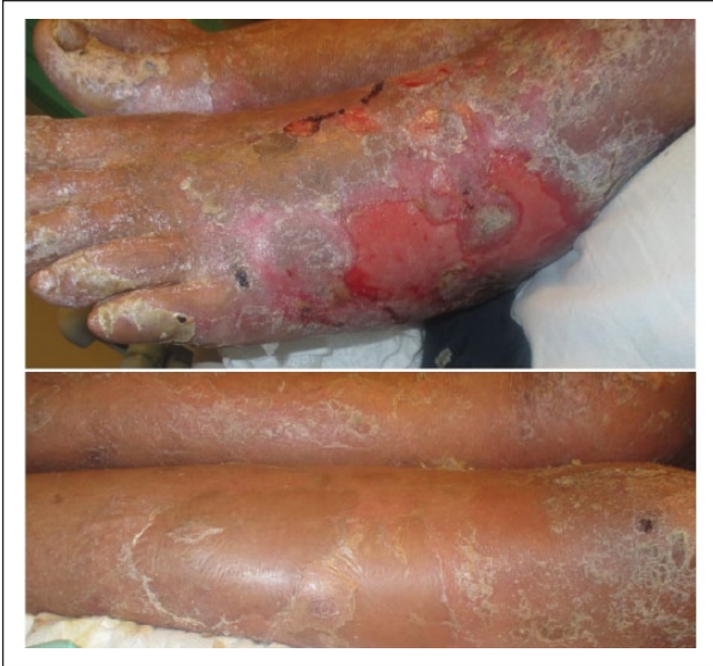
Figure 1. Severe cutaneous reaction of the lower extremities present approximately 2 weeks after the last dose of idelalisib. Top panel: Exfoliation of the dermis of the foot. Bottom panel: Concurrent scaling of the lower legs.

classified as having idelalisib-induced exfoliative dermatitis secondary to a severe cutaneous adverse drug reaction.