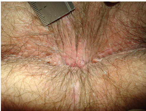
Figure 4a This 32-year-old man is in knee–chest position with his head left. He complained of anal itch at times combined with anal bleeding and pain. We see an inconspicuous anal verge covered with hairs.