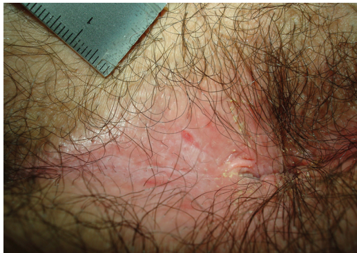
Figure 1b The same patient after gentle eversion of the anal skin by the finger tips of both hands of the investigator: A reddened and whitish anal skin surrounded by hairs is found. The anal skin shows longitudinal superficial splits (perianal dermatitis/pruritus ani).