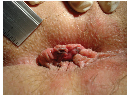
Figure 2a The 54-year-old woman is in knee–chest position, head left. She complained of anal bleeding, and pain. The anal verge is surrounded by anal tags without signs of inflammation such as edema or a reddened skin.