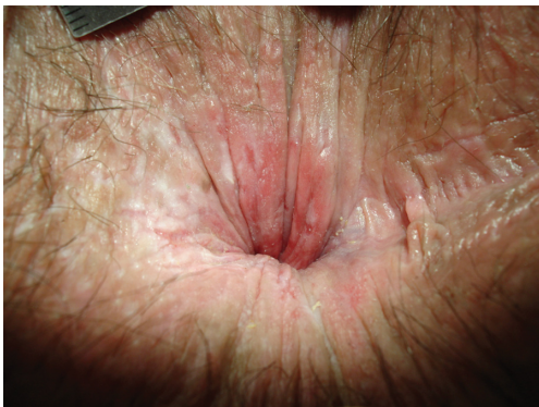
Figure 4b Only by eversion of the anal skin by use of the finger tips of both hands, a whitish anal skin appears distal to the dentate line. It is covered with longitudinal superficial red splits and spots (pruritus ani/anitis/perianal dermatitis).

diagnoses in different proctological positions are unknown to find out causes of anal bleeding, itch, or pain randomized clinical trials are needed to find out optimal proctologic positions for both: concomitant anal findings and benign anal diseases. Patients' answers to our questionnaire authorize doctors to do so since none of different proctological positionings are most embarrassing to them.