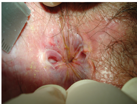
Figure 1c Looking at anal verge of the same patient after strong eversion of the anal skin two chronic anal fissures (posterior and anterior) appear surrounded by a pale skin covered with partially bleeding superficial longitudinal splits.