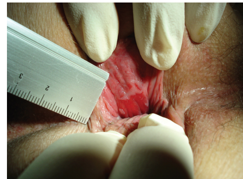
Figure 2b By gentle eversion of the anal tags by the finger tips of both hands of the investigator the dentate line appears with bright red columnar epithelium distally (hemorrhoids). Proximal the dentate line a small superficial split 3 mm to 4 mm in length within the squamous epithelium is seen (superficial fissure).