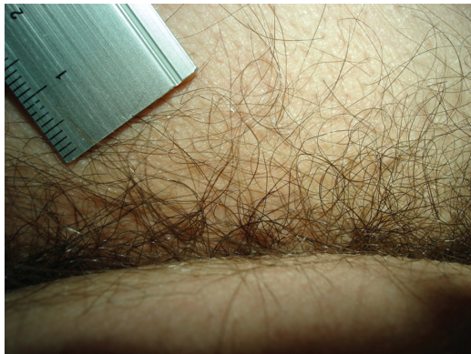
Figure 1a The 42-year-old man is in knee–chest position, head left. He complained of anal itch, bleeding, and pain. Hairs are seen at the buttocks in the unevverted anal region.

intestine may be pulled down towards the patients' head so that the hemorrhoids may be unable to protrude. 1,2 However, it may provide a better field of view on anal and perianal surface than broadly used left lateral Sims' position, as the buttocks fall to each side, and finger tips of both hands of the investigator are free for gentle eversion of the anal skin, which may assist in more differentiated, and therefore more reliable diagnoses in good lighting 1,6 (Figures 1–4).