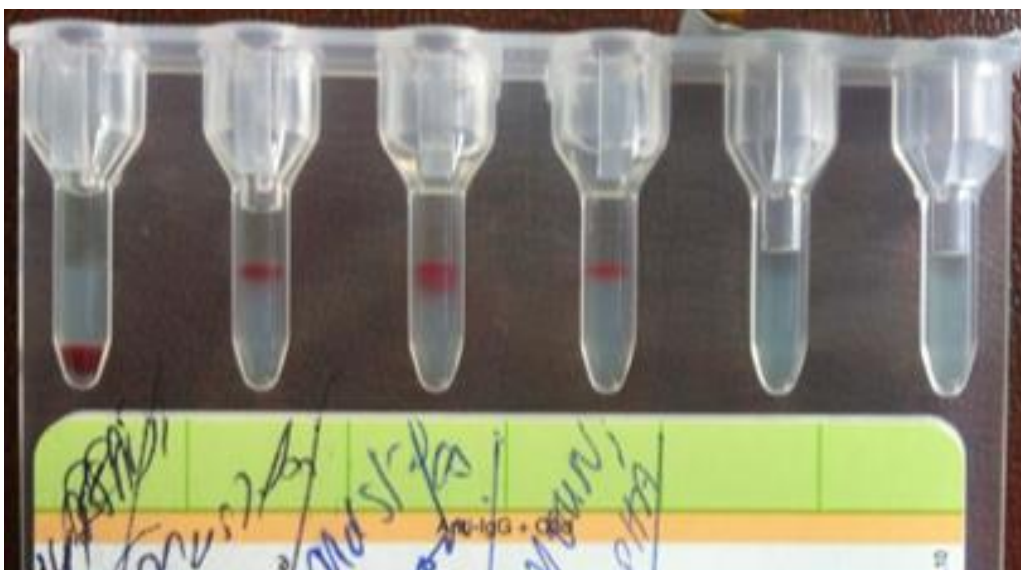
Figure 3: direct antiglobulin test (DAT)