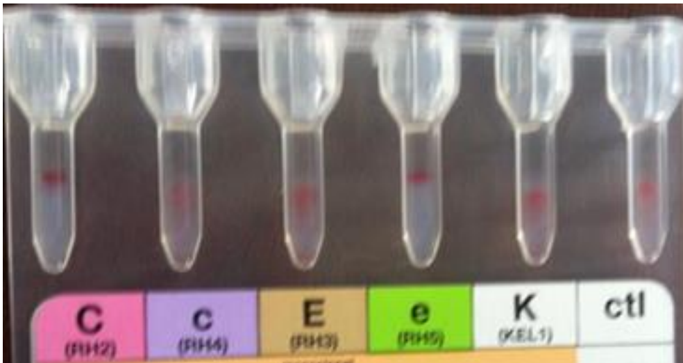
Figure 2: RHKEL1 were in-interpretable