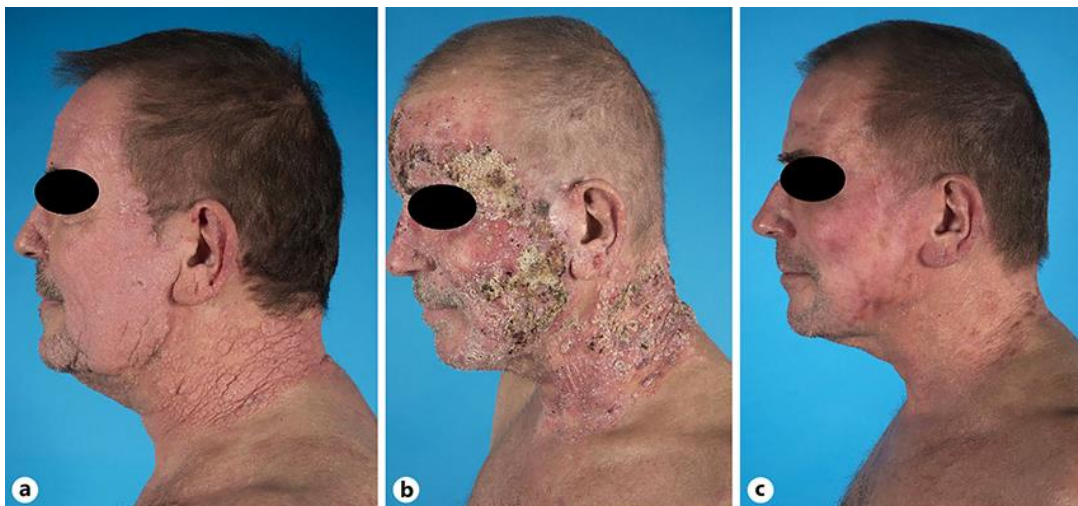
Fig. 3. Clinical images. a Before therapy with IFNα. b During therapy. c After 2 months of therapy.