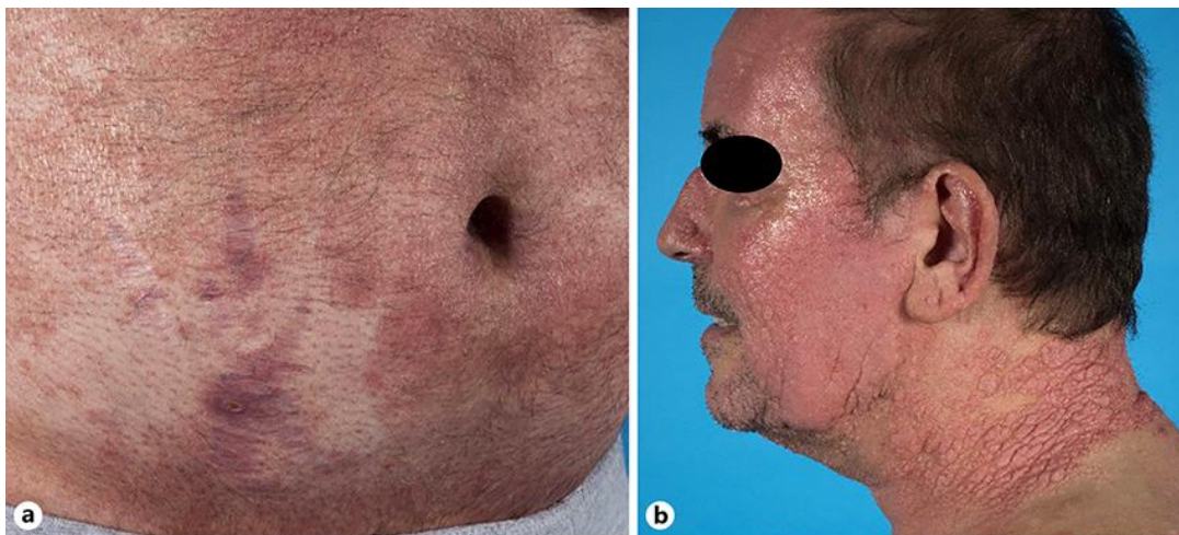
Fig. 1. Clinical images of the patient. a Alopecia and generalized erythematousquamous patches on the trunk. b Tumorous lesions on the neck and face.