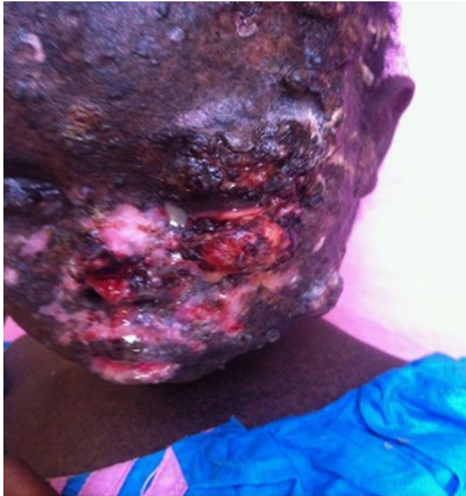
Fig. 3. Multiple ulcerative budding tumors in the midface region with an extension into the left eye and other tumors of the scalp in an 8-year-old girl (case 3, Dakar, Senegal).