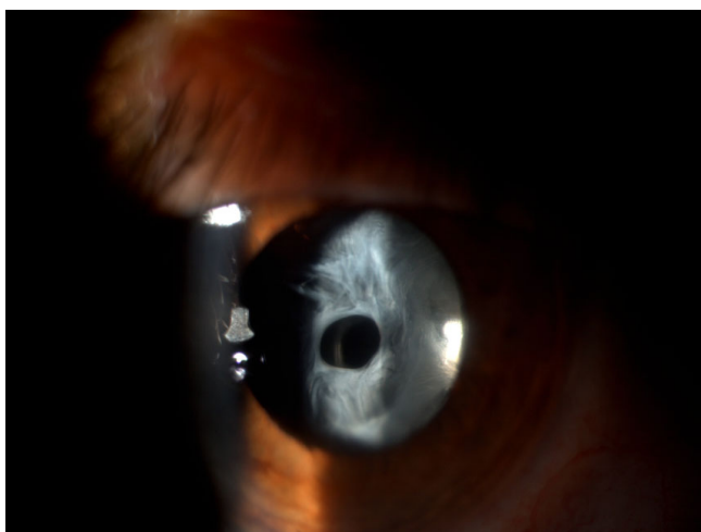
Figure 1 Slit lamp examination showing a dense fibrosis of the anterior capsule with anterior capsule phimosis.

The patient was placed on hypotonizing topical therapy, and a surgical peeling of the anterior capsule was performed. The following days the slit lamp examination showed the presence of slightly milky fluid behind the IOL and a distended capsular bag, that was confirmed by Pentacam (Fig. 2), that were not detected before for the presence of the opaque anterior capsule. The IOP was still 30 mmHg. A YAG laser posterior capsulotomy was attempted but no decrease in the IOP was obtained.