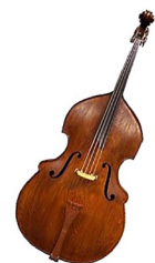
Figure 2. The case of the bass at the base.