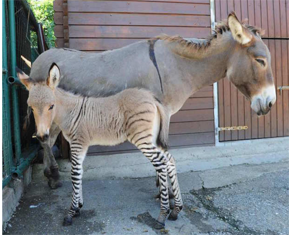
Fig 1. Zebroid. The newborn zebroid ( 2n = 53, XY ) on the left, and his mother donkey ( Equus asinus , 2n = 62, XX ).

https://doi.org/10.1371/journal.pone.0180158.g001