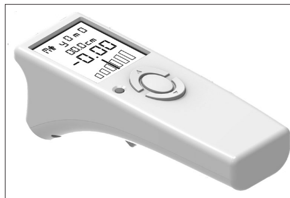
Figure 2. Prototype of electronic MUAC z -score tape.

Based on the comments received, we also felt that it was important to proceed with the fabrication of an electronic prototype (Figure 2). The electronic embodiment requires the user to input gender and age in months. It then reports the MUAC in millimeters and the MUAC z score as a discrete number rather than a range. We incorporated a large LED display into the design that should address the concerns of legibility and confidence in interpreting the values. The device utilizes a retractable measuring strip to improve portability, and both the measuring strip and exterior housing are constructed from materials that can be sanitized. While we see a continued role for the paper-based version in the setting of nutritional screening, the electronic version might find