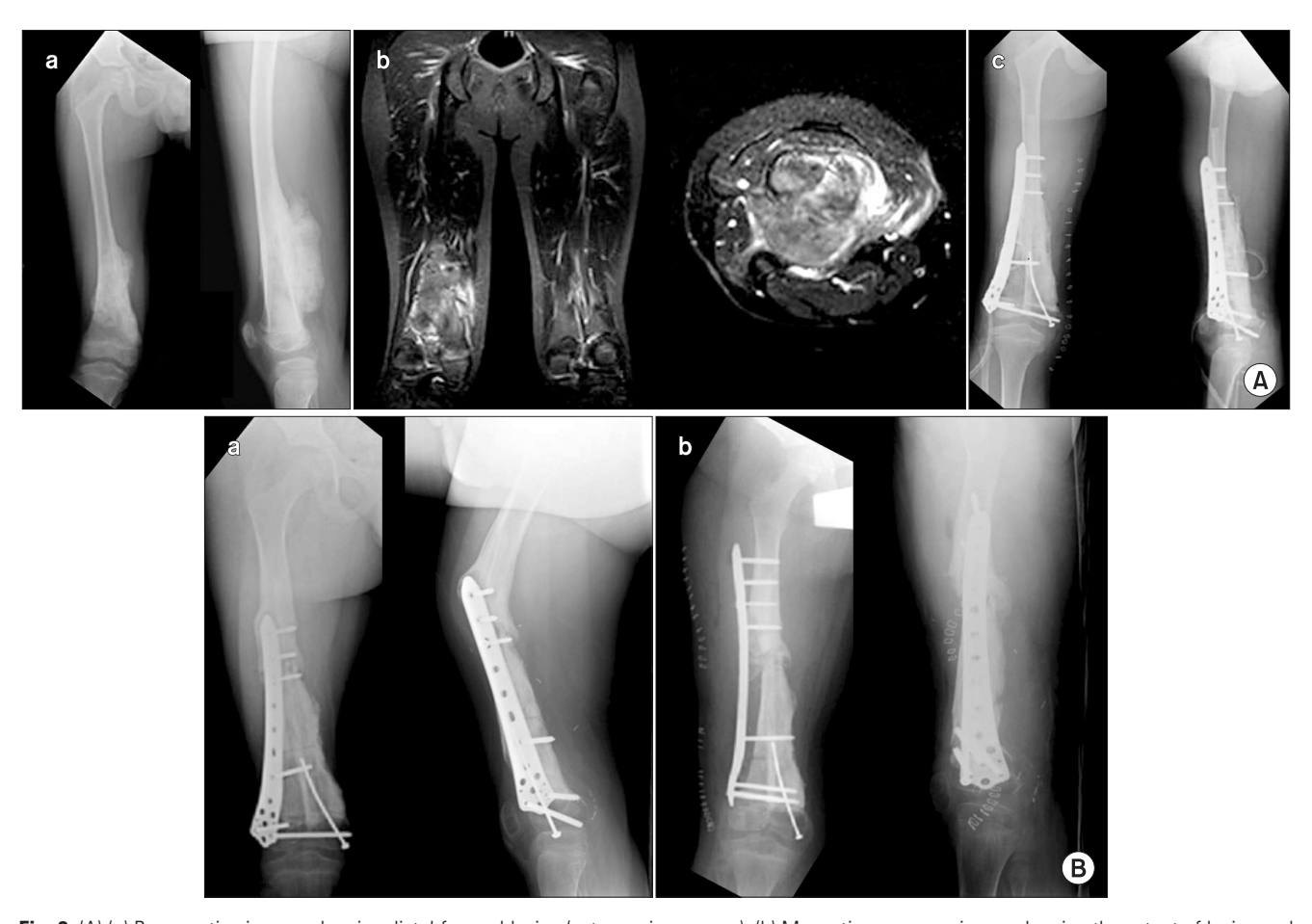
Fig. 2. (A) (a) Preoperative images showing distal femoral lesion (osteogenic sarcoma). (b) Magnetic resonance image showing the extent of lesion and sparing neurovascular bundles. (c) Immediate postoperative X-rays showing reconstruction with autoclaved bone and fibula and osteosynthesis with locking compression plate for distal femoral fracture. (B) (a) Nine-month postoperative X-ray showing angulation in saggital plane at the site of delayed union. (b) Revision of osteosynthesis with a longer plate and correction of angulation.

A comparative study in pediatric population showed union in 13.1 month in 75% of the patients fixed with a locking plate, compared to 14.6 months with the standard compression plates. Additionally three patients developed nonunion in the former group, out of whom two healed after autogenous bone grafting, with the third patient requiring a revision of plate for persistent nonunion. <sup>16)</sup> Another study from India reported the union time of onemonth following fixation of pathologic fracture and 120 days after limb salvage surgery. <sup>17)</sup> In our study, the average union time for curative resection and reconstruction