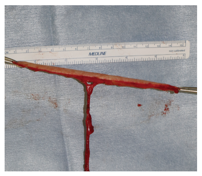
Fig. 3. After confirming adequate blood perfusion throughout the flap by dermal bleeding and indocyanine green imaging, the flap was isolated. The thickness of the flap after defatting was 3 mm.