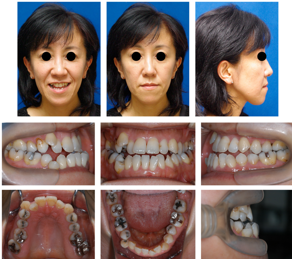
Fig. 1. Facial and oral photographs in pretreatment.