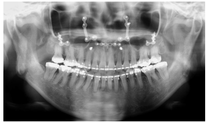
Fig. 2. Panoramic X-ray after the segmental Le Fort I osteotomy and IVRO.

imposition. From the post-operative bimaxillary stability shown in Fig. 4, it appeared that regeneration of the normal jawbone had occurred. It was also confirmed that the bone joining was performed normally even at the maxillary posterior part and the overlapping part of bone of the mandible IVRO (Fig. 5, arrows).