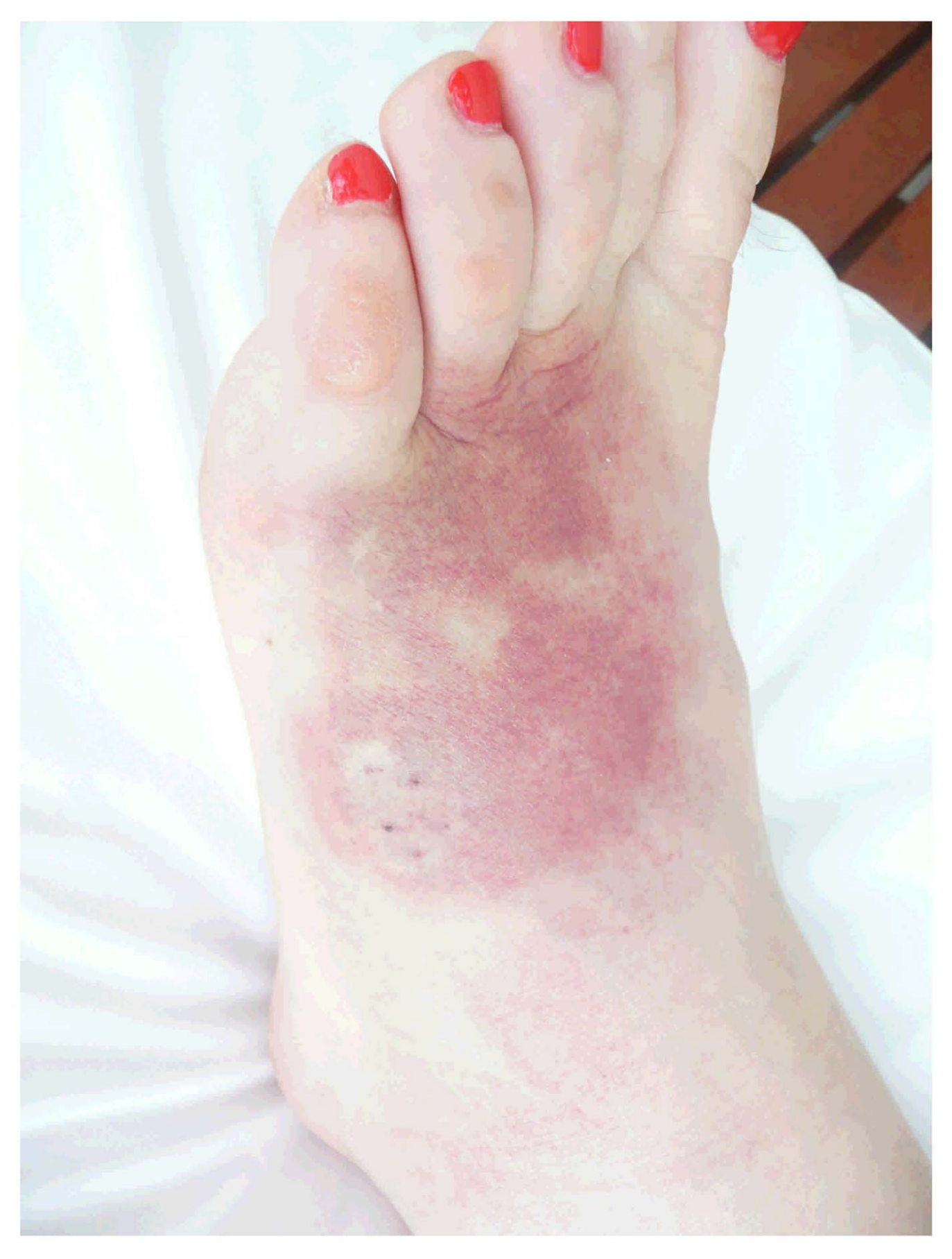
Figure 2. Local effects from a death adder bite to the foot. doi:10.1371/journal.pntd.0001841.g002