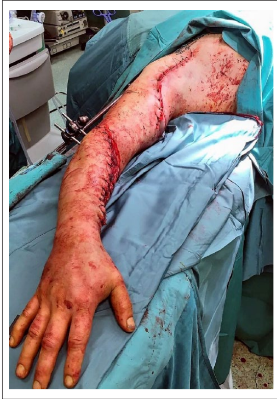
Figure 1. Right upper limb after surgery.

physiological hypoperfusion of the renal medulla, which makes it extremely sensitive to ischemia.