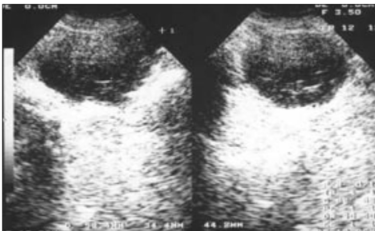
Figure 1. Abdominal ultrasound showing the cystic mass of approximately 5.3 cm in diameter at ileocaecal localization.