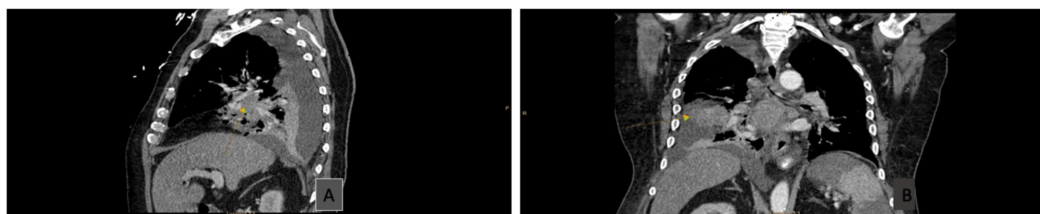
FIGURE 2: CT chest

Given his pneumonia and bacteremia, infective endocarditis was initially considered, and a plan for a prolonged course of antibiotics was elected. However, the morphological appearance of the valve lesions on the TEE sparked concern for NBTE. Given his recent deep venous thrombosis and lung consolidation on chest radiograph, the cardiologist advised checking for underlying malignancy. Computed tomography of the chest showed a mass-like consolidation in the posterior right lobe with evidence of metastasis with multiple bony lytic lesions and pleural metastasis (Figures 2-3). Blood cultures were subsequently determined to be contamination. The patient and his family decided not to proceed with any further investigations and opted for comfort care measures only.