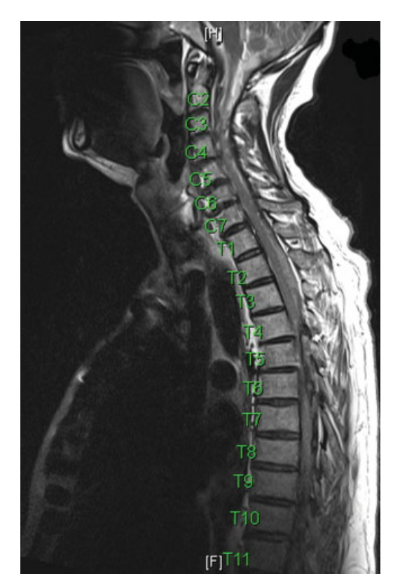
Fig. 4 MRI image of the thoracic spine showing intraspinal hemorrhage. MRI, magnetic resonance imaging.

Concerning both hemorrhages, a conservative treatment was considered the best option for the patient. The intraspinal hemorrhage was mostly located anterior and over a long distance in the vertebral column, so posterior decompression was not indicated. Because there was no active hemorrhage