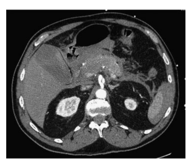
Fig. 1 CT scan which shows the dissection in the aneurysm at the celiac trunk and the surrounding intra-abdominal hemorrhage. CT, computed tomography.

was a near complete paralysis of both legs with loss of reflexes. However, a normal perianal sensibility and normal anal sphincter tone were present.