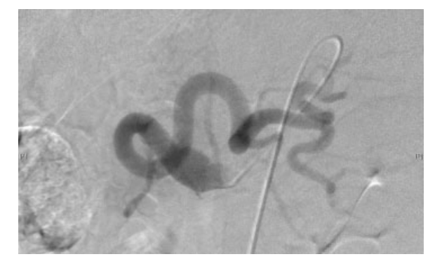
Fig. 3 Angiographic image of the aneurysm. There is no "blush," no active hemorrhage, seen on the image.

blood. Compression of the spinal cord at the midthoracic level was observed ( Fig. 4 ).