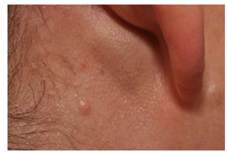
FIGURE 1 Posterolateral (left) and posterior (right) views of postauricular swelling