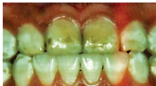
Image 2: The second image showed fluorosis and the diagnosis was severe dental fluorosis, and invasive treatment would be recommended.

Source: Projeto SBBrazil 2010: Pesquisa Nacional de Saúde Bucal – Resultados Principais. http://dab.saude.gov.br/CNSB/sbbrasil/arquivos/projeto_sb2010_relatorio_final