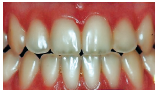
Image 1: The first image shown when applying the questionnaire had normal teeth with no changes. The diagnosis was teeth with healthy enamel.