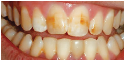
Image 10. Teeth with moderate fluorosis

Image 10: In the last image, the diagnosis was moderate fluorosis and non-invasive treatment would be recommended.