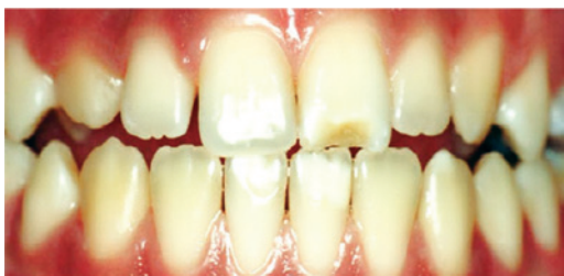
Source: Projeto SBBrazil 2010: Pesquisa Nacional de Saúde Bucal – Resultados Principais. http://dab.saude.gov.br/CNSB/sbbrasil/arquivos/projeto_sb2010_relatorio_final

Image 3: The diagnosis of the third image was hypoplasia.