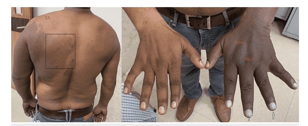
FIGURE 2: Red and pinkish lesions resembling the Port-wine stain on the left side of the posterior chest wall denoted by a black rectangle (A), and thick coarse skin and white pale nails denoted by red and green arrows, respectively (B)

On the left side of the posterior chest wall, medial to the extensive blue-black pigmentation, there were geographically shaped macular red and pinkish lesions resembling the port-wine stain (Figure 2A). All these lesions have been present since the birth of the patient. Additionally, the affected limb was pale at the time of presentation since the patient had been there for a couple of hours in our cold hospital environment compared to the normal limb. On detailed general examination, the hairs were normal, the nail bed was pale, and the left upper limb was a little more gigantic with thick coarse skin than the other limb (Figure 2B).