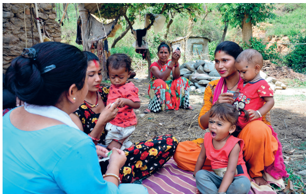
Photo: Community health worker counseling family members in rural Nepal (from Nyaya Health Nepal, used with permission).

The FCHV program has served as the backbone of Nepal's community health system and has been the foundation for gains made in recent decades. Today, FCHVs continue to serve as critical pillars for behavior change communication including maternal and child health, and for selected services including family planning, oral rehydration salts, vitamin A distribution, and outreach clinics.