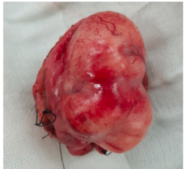
Fig. 2. Large solid bladder mass approximately measuring 6 \times 6 \times 5 cm.

He subsequently underwent laparotomy and partial cystectomy of urinary bladder tumour with 1 cm margin under general anaesthesia. Intraoperative findings showed a large solid bladder mass measuring 6 \times 6 \times 5 cm not infiltrating to sigmoid colon or any adjacent organs. We clinically diagnosed it as a mesenchymal tumour. Excised mass was sent