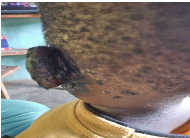
FIGURE 2 Showing necrotic external ear with some mutilated sites prior treatment

betamethasone cream which was applied topically over the ulcerated external ear, syrup ampicillin + cloxacillin 250 mg administered 8 hourly for 7 days and boric acid ear drops were applied 4 hourly for 7 days. The patient was followed up for 6 months with no recurrence. (Figure 3).