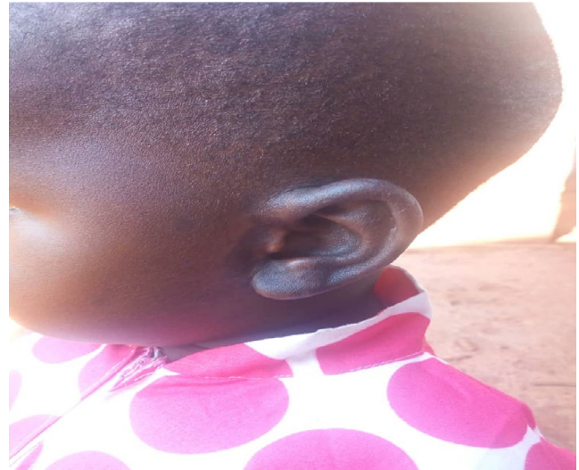
FIGURE 3 Showing complete healing of the external ear after 6-mo follow up

PG affects mainly adults aged between 20 and 50 years with female predilection. It account for only 4% of cases in children