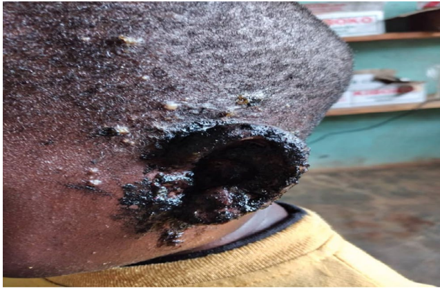
FIGURE 1 Showing necrotic external ear with some pustules before treatment initiation