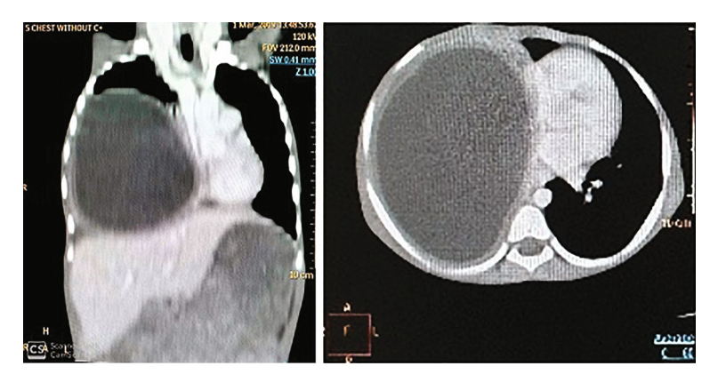
FIGURE 2: CT scan showing cyst in the right hemithorax.

uneventful. The tube thoracostomy drain was removed on day 11 and the patient was discharged on the 12<sup>th</sup> day.