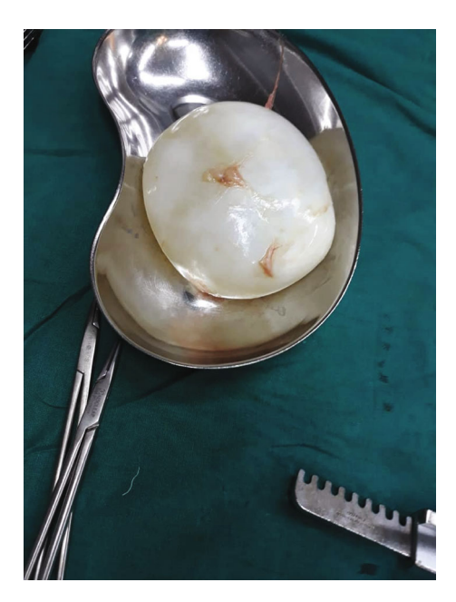
FIGURE 3: Hydatid cyst.