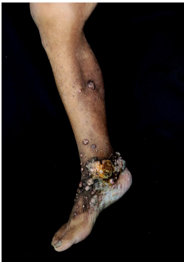
Figure 1 Keloid-like papules and nodules on the right lower limb.

structures more clearly (Fig. 3A). Direct mycological examination showed elliptical, thick-walled fungal elements in a chain-like arrangement, isolated or presenting single budding.