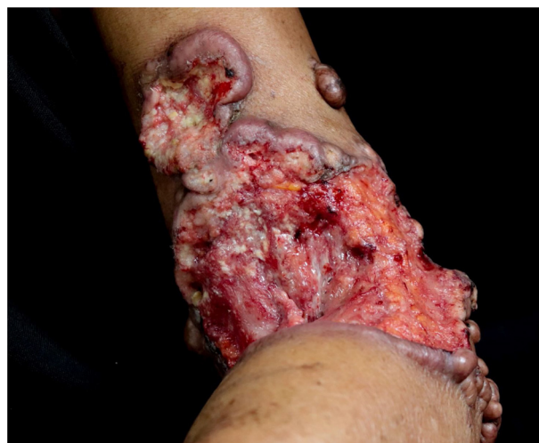
Figure 2 Ulcerated tumor, with exposed tendon, bleeding, raised edges, and presence of keloid-like nodules.

Histopathology of the left upper limb tumor showed a dense lymphocytic inflammatory infiltrate, presence of horn pearls and proliferation of squamous cells with moderate pleomorphism, hypertrophic and hyperchromatic nuclei,