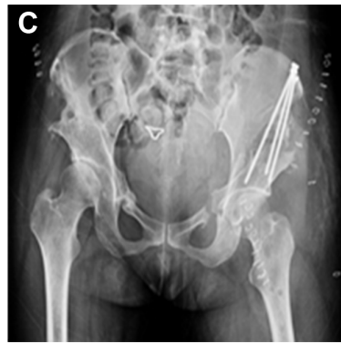
Figure I The AP view (left side) of postoperative radiographs for MSP (A), I-I (B), and TSP (C). Abbreviations: AP, anteroposterior; I-I, improved ilioinguinal; MSP, modified Smith-Peterson; TSP, two-incision Smith-Peterson.

increase compared to the other two groups with P<0.05. TSP and MSP groups have no significant difference (P>0.05). Allogeneic blood transfusion of I-I approach group was higher than that of the TSP group (P<0.01); the MSP group has no significant difference compared with the other two groups with P>0.05.