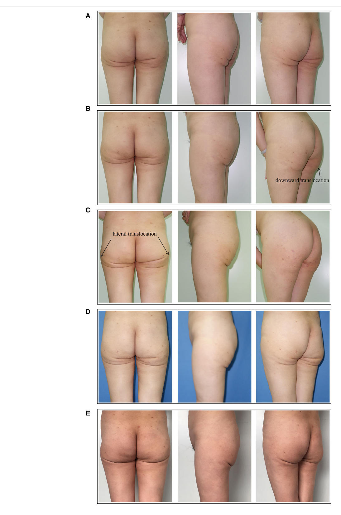
FIGURE 3 | (A) Postoperative view of the patient 4 months after the 1st reconstructive operation. Little improvement of the deformity was seen. (B) Postoperative view of the patient 3 months after the 2nd reconstructive operation. The multiple infragluteal folds on the left side were slightly improved. The arrow indicates that the downward translocation of fat and the convex deformity. (C) Postoperative view of the patient 3 months after the 3rd reconstructive operation. The gluteal contour (Continued)