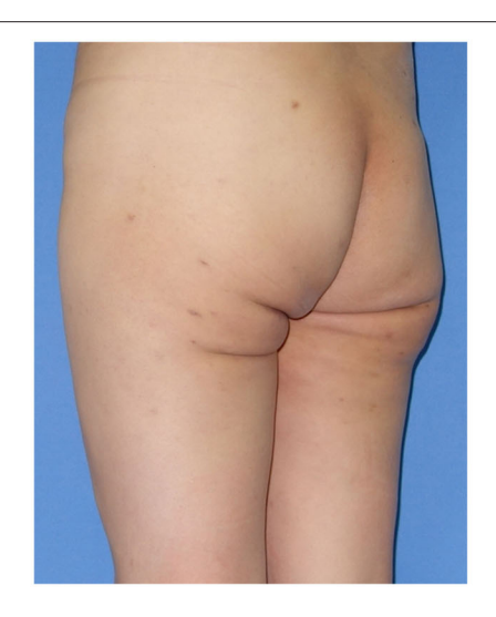
FIGURE 1 | Pre-reconstruction view of the 37-year-old woman with iatrogenic infragluteal deformity. The deformity was displayed on both sides, including infragluteal region depression, multiple and asymmetric infragluteal folds, and gluteal ptosis.