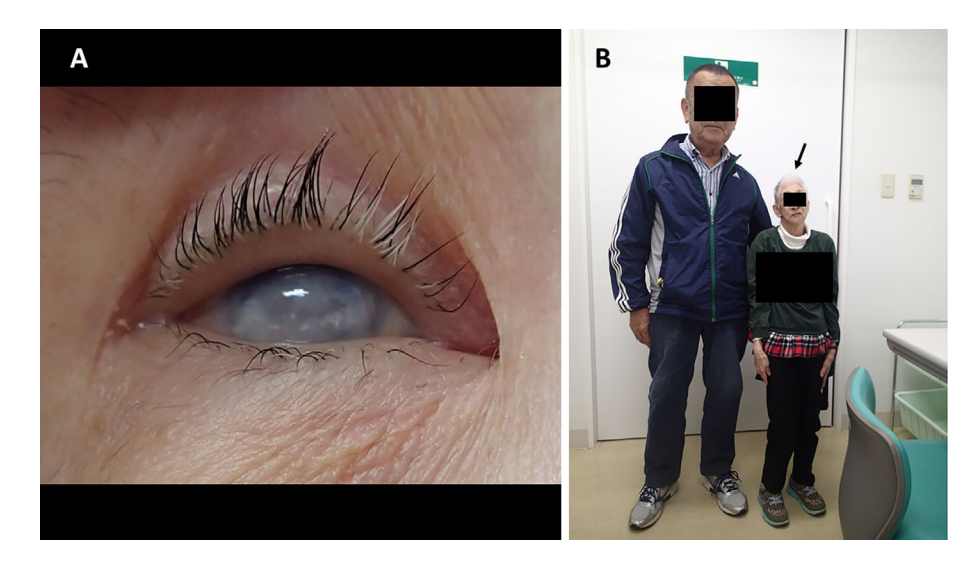
Figure 1. Physical features of the patient. Right eye and whole-body images show the presence of a cataract (A), dwarfism and microcephaly (B, arrow).