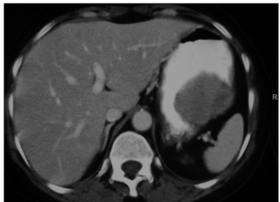
Figure 4: Contrast-enhanced computed tomography scan showing gastric mass with minimal extension into lesser sac