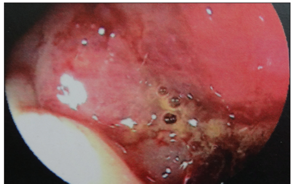
Figure 2: Colonoscopy image showing ulceration in the sigmoid colon

Primary squamous cell cancer of the stomach is a rare entity (fewer than 100 cases of primary SCC of the stomach have been reported in the literature) and whenever it occurs is usually the result of metastasis from a different primary. The primary sites generally include esophagus, skin, lung, cervix, breast, sigmoid colon and testis. [3] They usually present as solitary lesions and are mainly located in the middle (40%) and upper third (40%) of the stomach. [4] The clinical presentation of gastric metastases mimics the primary gastric tumor, as symptoms can be nonspecific and include dysphagia, dyspepsia, anorexia, abdominal pain, early satiety, nausea, vomiting, bleeding and anemia. The radiological and endoscopic findings can also be similar to those of primary gastrointestinal tumor. The discovery of gastric tumor in a patient with a history of cervical cancer is more likely to be a primary gastric lesion, but metastasis from cervical cancer may be possible and must be ruled out. Cervical cancer metastasizing to the stomach is a rare event with probably none reported in the literature although duodenal metastasis has been reported. [1] Most common sites of distant metastasis from cervical cancer are lung, liver and supraclavicular lymph nodes and unusually to brain, heart, skin, thyroid, spleen. Carcinoma of the cervix usually spreads in an orderly