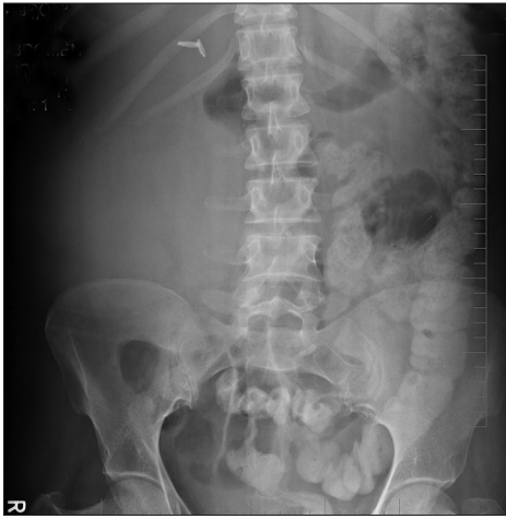
Figure 1: Digital X-ray KUB showed a large soft tissue density in right lumbar region with loss of right psoas shadow, blurring of preperitoneal fat planes, displaced bowel loops and mild scoliosis of spine