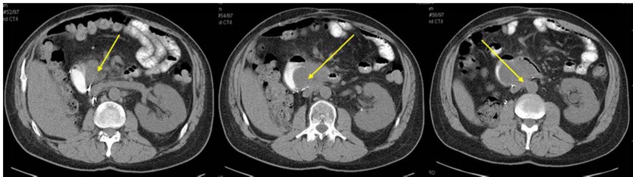
Figure 1 Recurrent tumor and relationship to the duodenum (left and center image) and large vessels (right image), as indicated by the arrows.

wall distal to the ampulla that filled the entire duodenal lumen. The patient underwent a duodenotomy and stalk transection of the polypoid mass, followed by partial duodenal resection with hand-sewn duodenojejunal anastomosis (Figure 2). Surgical pathology examination revealed a 9.5 cm recurrent high-grade liposarcoma with polypoid intraluminal growth containing myxoid, round cell, well-differentiated, sclerosing and focally pleomorphic areas. Surgical margins were negative as the tumor came within 0.1 cm of the stalk margin and there was no evidence of additional neoplastic components within the remaining resected duodenum. The post-operative course was uncomplicated, and the patient has demonstrated no recurrence up to 30 months from this resection.